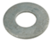
AS 1237-1973 Table 4.1