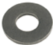
AS 1237-1973 Table 4.2